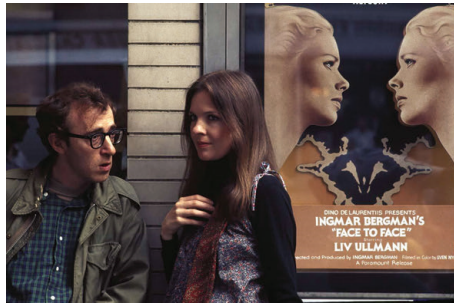
Figure 10 - Annie Hall (1977). The evolution of personality and individuality in the character of Annie becomes a turning point in her relationship with Alvy.

was changing, commencing to give women the new rights while contradictorily, merely sending them the underlying message to take the traditional path. Alvy pushes Annie to take university courses, grabs her subconscious into his own world, but then backlashes her individuality. Loves her independency and even asks for it, but suffers from the same trait.