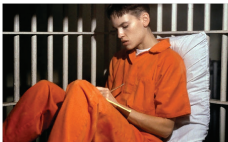
Figure 6 - Boys Don't Cry (1999), directed by Kimberly Peirce. The story of a young man discovering to be a transgender.

"Transvestism provides an eye-opening link in this research between two theoretical fields – material culture and gender – because it lies at the intersection of the two. For many decades now, sex and gender have been popular and well-studied topics and the implications, which certainly affect our lives in a multiplicity of ways, both directly and indirectly, have been of particular interest to academic research and to feminism." (Suthrell 2004, 14)