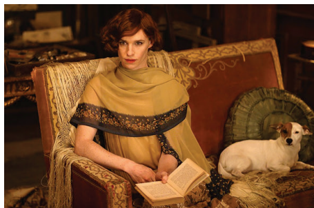
Figure 5 - The Danish girl (2015), directed by Tom Hooper. Einar Wegener discovers his life-long identification as a woman during his posing as a female model for his painter wife.