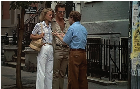
Figure 2 – A scene from the movie: Annie Hall (1977) in which a couple in the street are dressed in the same style.

in pants, in everyday life. An overall comparison of women's most common fashion in the 1960s and the 1970s, notifies a revolution, a huge change, although there still exists remains of the effects of the previous decades in the following ones. But during these years women, along with the other social rules, could establish a new atmosphere for them where traditional expectations from any feminine creature would no more serve as her inevitable fate. This became a chance for women to choose becoming a mother, a time for economic independence of women as they started working. Although not every clothing style should be considered as fashion, as we know fashion has its "exclusive ambiguous definitions", but it cannot be underestimated the roles of these progressions in women's rights demands in their dressing styles. The similarity of the commonest style of this decade for both genders is due to this regard.