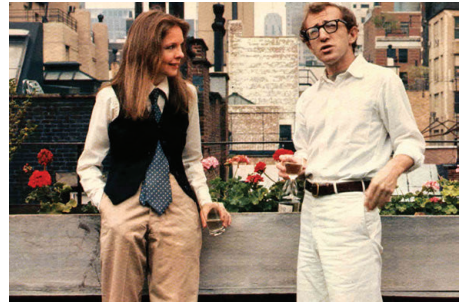
Figure 9 - Annie Hall (1977) Annie dressed in a menswear with touches of femininity.