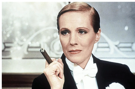
Figure 4 - Victor/Victoria (1982), directed by Blake Edwards. After her failed singing audition, Julie Andrews disguises in menswear, pretending to be a gay Polish female impersonator.