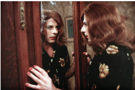
Figure 8 - The Tenant (1976), directed by Roman Polanski. Trelovsky (Roman Polanski) finds himself changing and transforming into the shape as well as the destiny of the dead woman who used to live in the same apartment he recently moved into, before committing suicide.