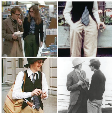
Figure 11 - Annie Hall (1977). Scenes from the film showcasing the costume style designed for Annie.