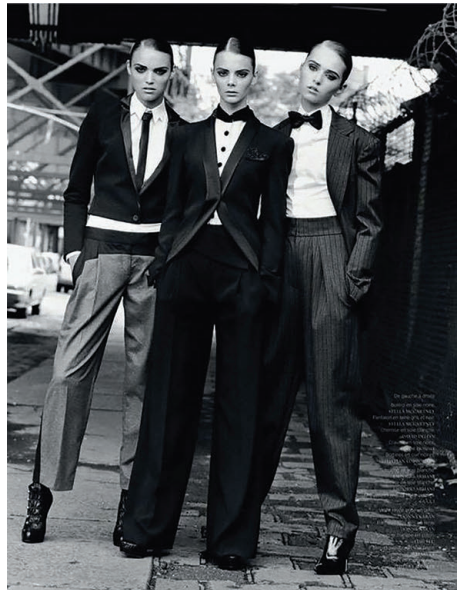
Figure 3 - Cross-Dressing Pictorials - The Multi-Model Editorial, 'New Faces' in French Revue De Modes (GALLERY)

Hot pants, flare pants, leisure suits, platform shoes, bell bottoms, ponchos, gauchos, capes, every transformation and exaggeration of the 60s, imitating music artists and popular movies; Afro hairstyle, Farrah Fawcett hairstyle, long shaggy hair... It all made a fantasy world in parallel to the real world seriously undergoing wars and reformations. Covering all the body with accessories as chokers, dog collars, handcrafted ornaments. Counteractions between designers and people, nothing of the total look remains. Fashion was to make a bricolage of every available piece. Jeans became the commonest wear for both men and women.