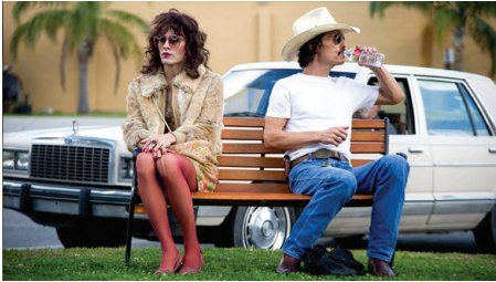
Figure 7 - Dallas Buyers Club (2013), directed by Jean-Marc Vallée. A combination of concepts such as AIDS, Drug addiction and transsexuality in Texas 1985.