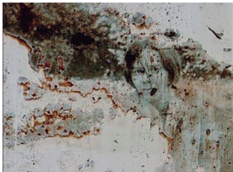
Tren de sombras (1997)

addition enriches the overall sense of place. The film's inter-war narrative, the conspicuous complacency of the bourgeoisie, the display of 'innocent' pleasures, focuses of the film's formal engagement rather than being evidence for a societal critique. The house is seen across time, and its setting, and contents, the personal artefacts, suggest that despite witnessing the twentieth century not much has altered. However, the contemporary vision does not feature any occupants, which hints that the house is now a relic.