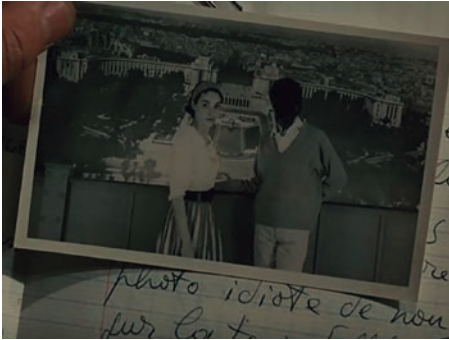
Muriel, or the Time of a Return (1963)