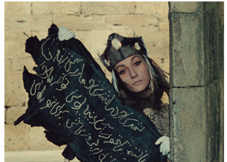
Figure 3.6-3.9 - Timecode: 0:28:29 – 0:30:02. Sayat-Nova at the tomb.

An interesting depiction of the duality of life and death can be found in the 2 nd and the last chapters of The Colour of Pomegranates . Sayat-Nova in Figure 3.10 is represented in complete frontality, while the skeleton head is in profile. In the same shot the poet slowly reaches for his eyes to cover them and hide from death, while he changes the skeleton to face the camera and the audience. A similar depiction can be found in Figure 3.12 where the aged poet is not hiding his eyes from death anymore, the skeleton is turned from profile to frontal position, while the ashugh does