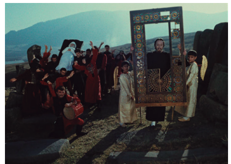
Figure 3.18-3.21 - Timecode: 1:07:45 | 0:10:59. Window to the poet's world.