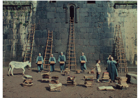
Figure 3.1 - Timecode: 0:07:00. Monks in the Monastery

According to film theorist Laura Mulvey (2006, p. 81), the stasis in film is produced by "a series of identical frames repeated in order to create an illusion of stillness to replace the illusion of movement." Parajanov creates the impression of motion and stillness simultaneously through the use of frontality. On one hand he achieves it by putting elements and figures within the space frontally and while most of the composition is still, he adds details of motion (e.g. the shot with the rain going down the cross-stone in the monastery, while the books and the rest of the mise-en-scène are still). On the other hand, he adds complete frontality to a moving scene and creates stillness.