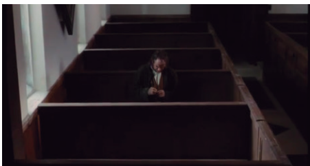
Figure 1.2 - B. Douglas, Comrades , 1986, Loveless in the Church, 01:08:51

In film cinematographers construct the shot using the principles of filmmaking that directly echo those of academic painting. Classical narration in cinema often needs image composition and editing to create a meaningful representation of three-dimensional space. In the classical Hollywood cinema narrative causality is often given dominance while the setting is subordinated and coherent with the story, and is used as a complimenting tool to help the narrative evolve. Whereas pictorialist filmmakers position the objects and actors within the frame in a way that creates new dimensions and strengthens the narrative visually, reflecting upon the ongoing actions, showing the psychological state of the characters, foreshadowing the upcoming events, initiating subplot. For example, in Comrades (1987) Bill Douglas positions his main character within the setting in a way as if putting him in a “box” which intensifies the dilemma and shows the irremediable situation.