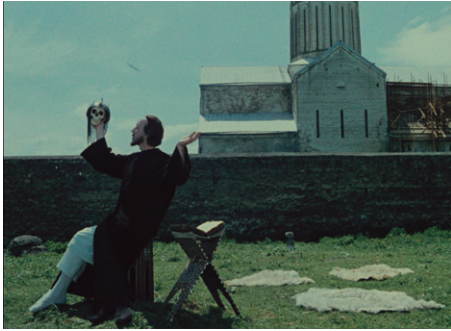
Figure 3.12 - Timecode: 1:13:29. Sayat-Nova and the skeleton.