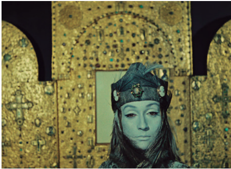
Figure 3.14, 3.15 - Timecode: 0:24:32 – 0:27:57. Sayat-Nova at the Georgian court.

reference in his film as Sayat-Nova himself encountered the art and lived surrounded by it, after he became a priest. So the use of miniatures is a measured addition to stylistically complete the character's journey.