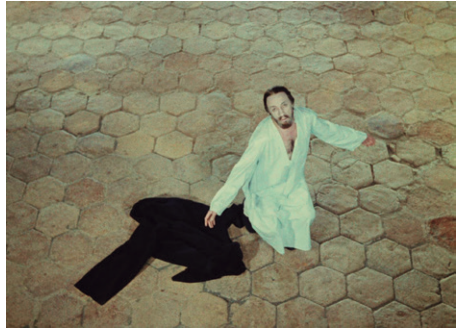
Figure 3.13 - Timecode: 1:16:28. Sayat-Nova sings and dies

Christianity plays a big role in the film: after the opening sequence the voice-over text tells the story of how God created humanity, while the visuals show images of cross, candles, Armenian cross-stones and monasteries. Parajanov uses miniature art as a