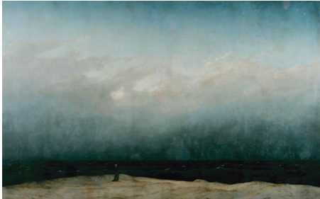
Figure 1.1 - Caspar David Friedrich. (1808-1810). The Monk by the Sea , oil painting, Alte Nationalgalerie (Berlin)

Artists apply art elements and principles (shape, form, colour, texture, rhythm, etc.) to determine the place of frontally oriented planes in pictorial space and to make depth relations visible. According to art and film theorist Rudolf Arnheim three-dimensional space offers complete freedom with “[...] shape extending in any perceivable direction, unlimited arrangements of objects, and the total mobility of a swallow.” (1974, p. 218) Visual imagery relies on these three spatial dimensions, and the level of perception can go beyond the observed information through imagination and intellectual construction. When looking at a painting or a still photograph the viewers exercise their knowledge of physical space to interpret spatial relations in an art piece.