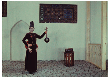
Figure 3.16, 3.17 - Timecode: 0:15:22 – 0:15:28. Harutyun becomes Sayat-Nova.

In the end of the 1 st chapter, Parajanov uses frontality to present the transformation of Harutyun into Sayat-Nova. The movement in the scene is theatrical as the boy slowly walks behind the figure on the left and hugs him from the back, merging with his adult self. The figure holds a kemenche in his hands: the innocent child has grown into an ashugh.