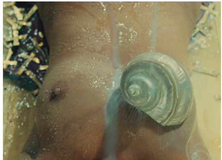
Figure 3.2-3.5 - Timecode: 0:13:26 – 0:14:39. Harutyun spies on people in the bath

Later in the chapter young Harutyun goes to the bath and spies on naked men and then on women (Figures 3.2-3.5). Parajanov creates a series of erotic shots as men and women bathe, looking into the camera and through it at the viewer. And for the first time, he depicts the boy from the back: by rejecting frontality, Parajanov makes us wonder what young Sayat-Nova's reaction is.