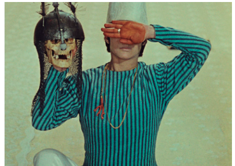
Figure 3.10, 3.11 - Timecode: 0:19:57-0:20:05. Sayat-Nova and the skeleton.