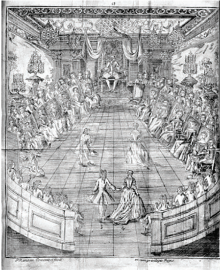
Figure 1 – “Le grand bal du Roy” in Pierre Rameau’s dance manual Le maître à danser (1 st edition 1725). (Rameau 1748, 53)