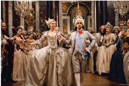
Figure 2 – The wedding dance scene. (Coppola 2006)