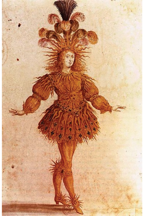
Figure 3 – Louis XIV as the Sun in Ballet royal de la nuit , 1653, drawing. Bibliothèque nationale de France (BnF), Paris.

soften and 'break them in', making them suitable for dancing, or when there is a beautiful close-up of the legs and feet of the young Louis as he rehearses a few steps, and performs a simple warm-up movement, a plié and elevé —at this moment, the spectator well-versed in dance immediately realizes that this is the body of a professional dancer (in fact, a female dancer plays this brief role), and the expectation is created that this would be a film that will resort to professional dancers in the other dance scenes.