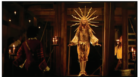
Figure 4 – The Ballet royal de la nuit scene in Le Roi danse . (Corbiau 2000)

The film shows very clearly how the parallel between the royal figure and the god Apollo, or the elaboration of the cosmic image of the Sun King, materializes through dance. The only scene in which the dance